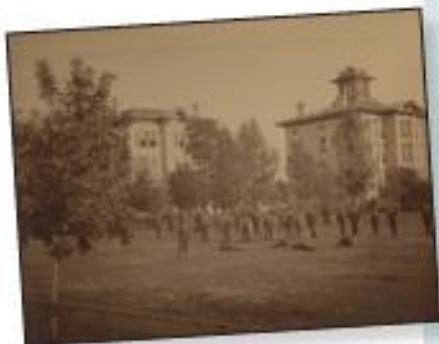
The Northwestern campus in the late 1880s; the building on the right is the Kaffeemühle, the first building constructed on the campus in 1865.

The timing wasn't great. The Wisconsin Synod was quite small. Most of the members were recent immigrants who had not yet established themselves financially in their new homeland. There just wasn't much money to go around. The United States was in the middle of the Civil War. The Battle of Gettysburg was only about a month away.