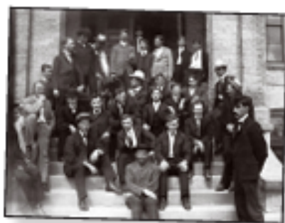
Seminary students on the front steps of the Wauwatosa seminary building in the early 1900s.